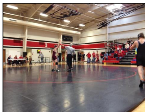
Panther Athletic Center