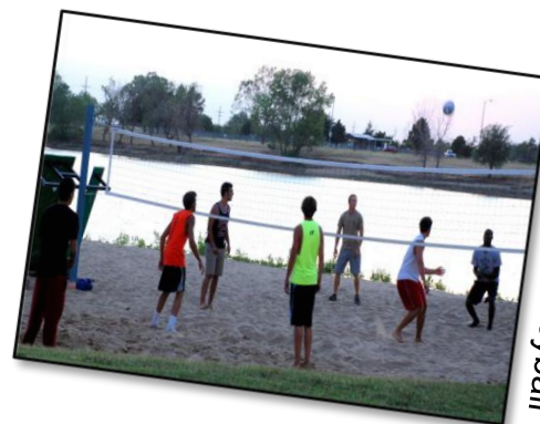
Vet's Sand Volleyball