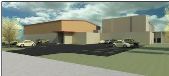
Architectural design of new gyms