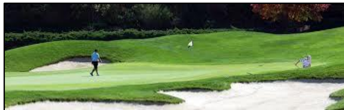
Lake Barton Golf Course