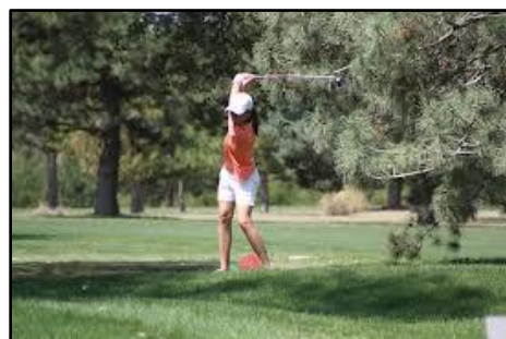
Stone Ridge Golf Course