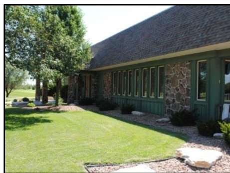
Stone Ridge Clubhouse