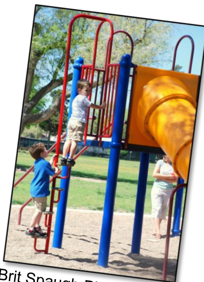
Brit Spaugh Playground