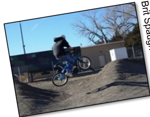
Brit Spaugh BMX Track