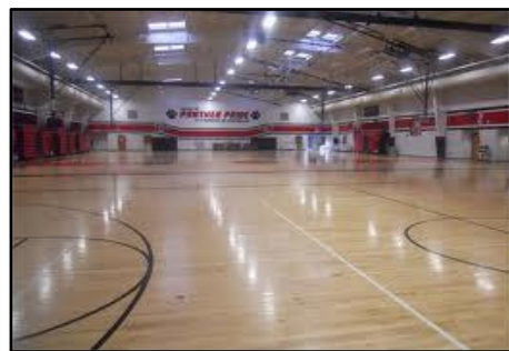
Panther Athletic Center