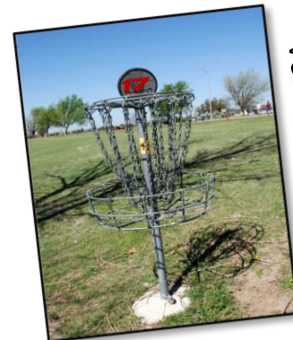
Vet's Disc Golf