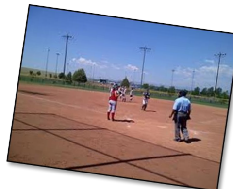
Vet's Softball Field